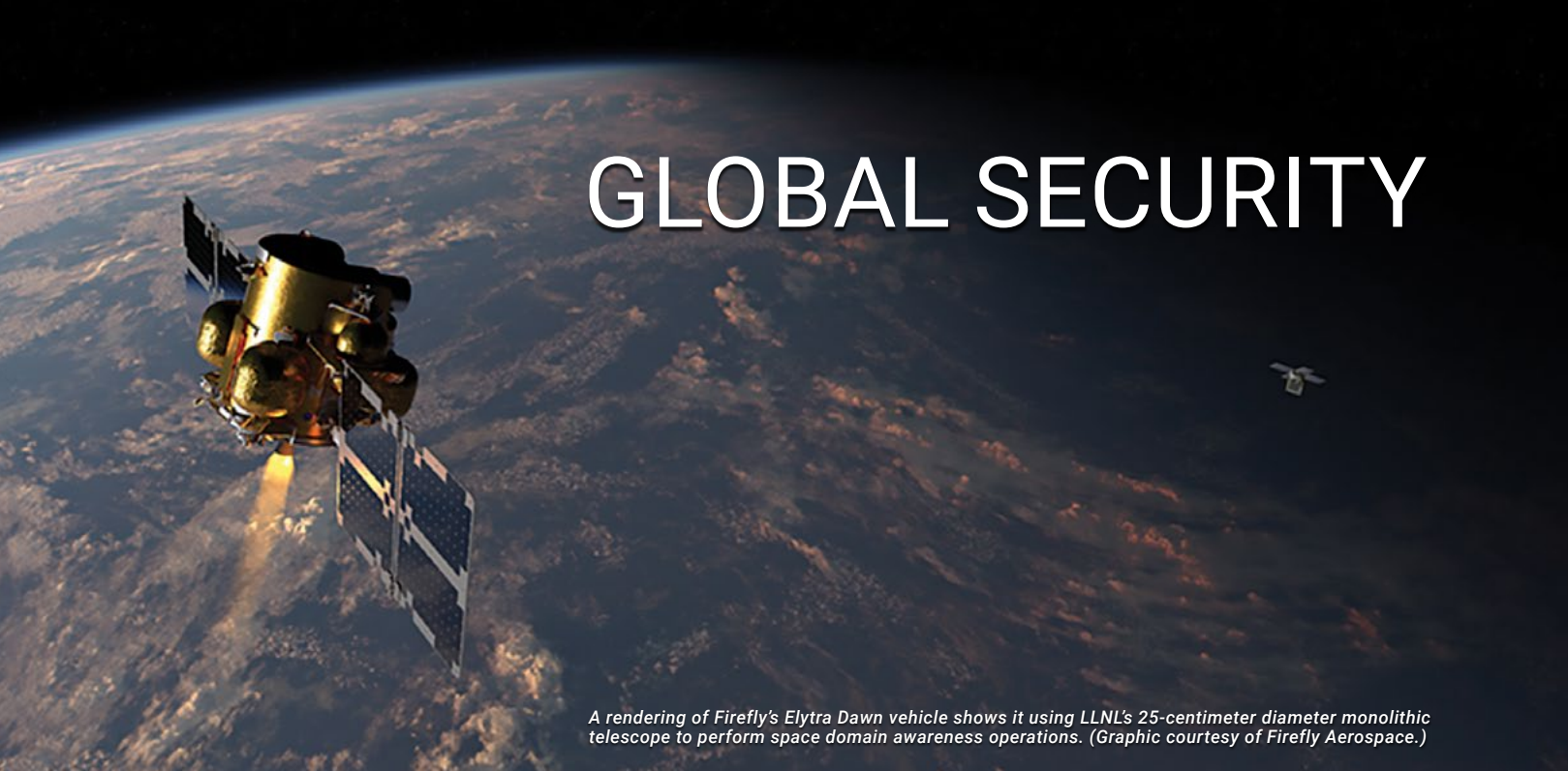
A rendering of Firefly's Elytra Dawn vehicle shows it using LLNL's 25-centimeter diameter monolithic telescope to perform space domain awareness operations.

Reducing the threat from terrorism and weapons of mass destruction, providing cyber and space security, and enhancing global strategic stability