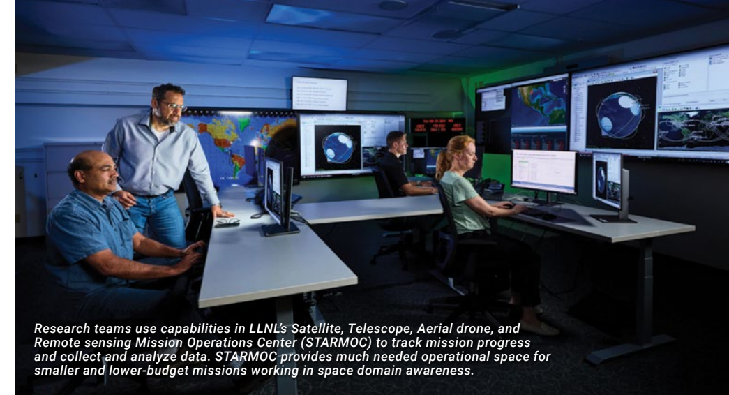
Research teams use capabilities in LLNL's Satellite, Telescope, Aerial drone, and Remote sensing Mission Operations Center (STARMOC) to track mission progress and collect and analyze data. STARMOC provides much needed operational space for smaller and lower-budget missions working in space domain awareness.

Supported by NNSA and other sponsors, Livermore executed a broad range of nuclear security and forensics activities, many in partnership with or for the International Atomic Energy Agency (IAEA). These efforts included technical exchanges, workshops, and scenario-based training with stakeholders from countries across Africa, Asia, Europe, and the Middle East. Activities ranged from advancing computer security and nuclear forensics to supporting equipment transfers, legal discussions, and the safe transition of radiological technologies. Many engagements were person-to-person, building relationships and technical capacity from Estonia to Egypt, Libya to Taiwan, Spain to Türkiye, and beyond. LLNL subject matter experts also provide support to the IAEA through guidance on document development; national, regional, and bilateral training events; and technical meetings, consultancy meetings, and bilateral assessments. In addition, in its efforts to secure, account for, and interdict the illicit movement of nuclear weapons, weapons-useable nuclear materials, and radiological materials, Livermore continued to use both in-person and virtual engagements covering security upgrades at nuclear and radiological facilities in Europe, the Middle East, North Africa, and Sub-Saharan Africa.