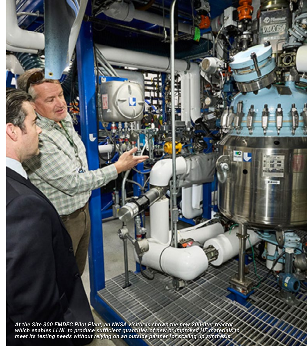
At the Site 300 EMDEC Pilot Plant, an NNSA visitor is shown the new 200-liter reactor, which enables LLNL to produce sufficient quantities of new or improved HE materials to meet its testing needs without relying on an outside partner for scaling up synthesis.

Success in the modernization programs requires an integrated effort within the NSE and strong partnerships with the U.S. Air Force, U.S. Navy, and their contractors. LLNL is spearheading groundbreaking initiatives to develop innovative materials and manufacturing techniques in conjunction with NNSA production agencies. The Polymer Enclave at LLNL has enabled researchers from the Laboratory and the Kansas City National Security Center to work side-by-side. This collaboration has led to a joint pilot demonstration of a product-lifecycle digital thread for direct-ink-writing parts.