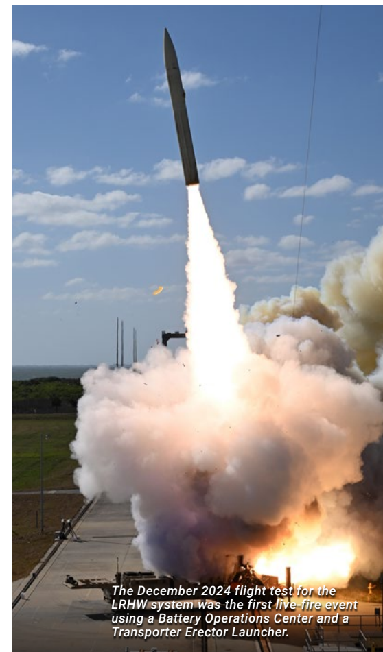
The December 2024 flight test for the LRHW system was the first live-fire event using a Battery Operations Center and a Transporter Erector Launcher.

The three NNSA laboratories are building Scorpius in a tunnel 1,000 feet underground at the Nevada Nuclear Security Site (NNSS). The football-field length machine will be NNSA's next-generation electron beam accelerator to diagnose subcritical experiments that compress plutonium to high density using high explosives. LLNL's responsibility is to develop and deliver a next-generation solid-state pulsed power system for Scorpius. Circuit boards in 984 line-replacement units (LRUs) rather than massive banks of capacitors will power the linear accelerator. Each LRU includes 45 printed circuit boards, totaling over 3 million electrical components in the pulsed power system. Production of the LRUs by vendors is underway, and the first four LRUs were delivered to LLNL in December 2024 for validation of the production process and quality testing before installation into Scorpius. In FY 2025, 220 LRUs were shipped to NNSS, and over the next three years another 780 LRUs (and 16 spares) will be delivered.