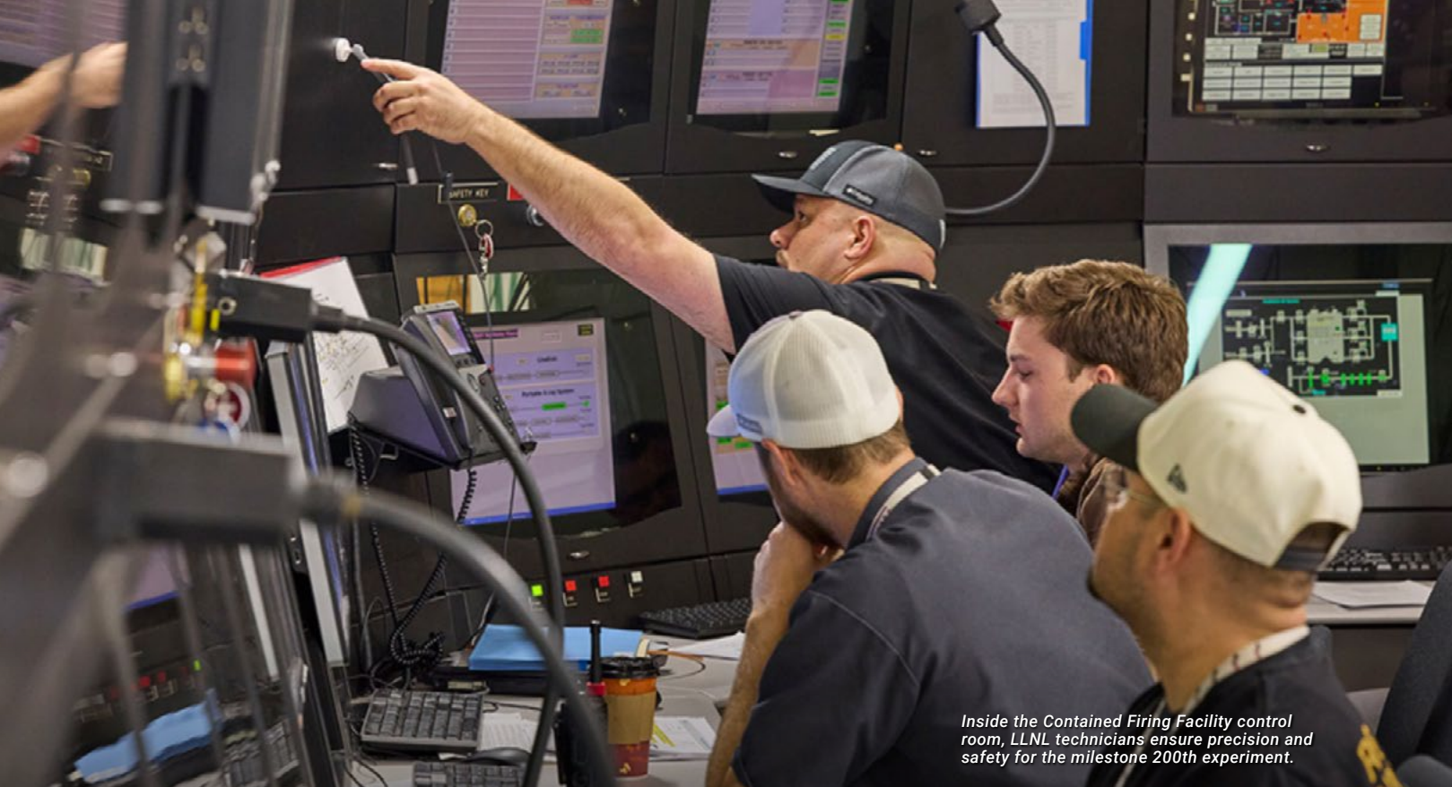
Inside the Contained Firing Facility control room, LLNL technicians ensure precision and safety for the milestone 200th experiment.