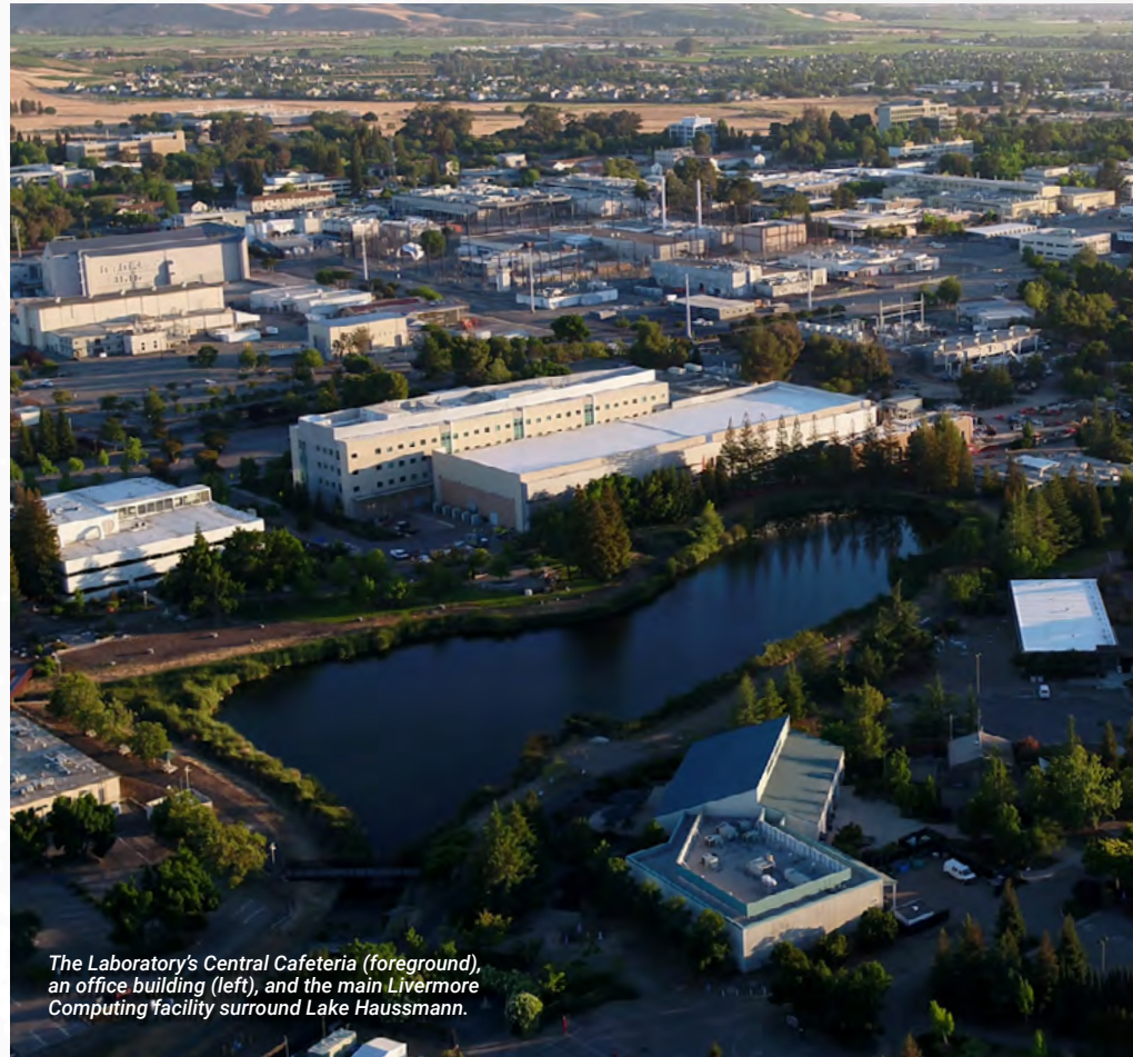
The Laboratory's Central Cafeteria (foreground), an office building (left), and the main Livermore Computing Facility surround Lake Haussmann.

Overseeing management and operation of the Laboratory for the U.S. Department of Energy and the National Nuclear Security Administration